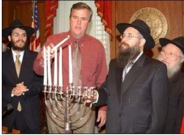
Governor of Florida, Jeb Bush (Brother of George W. Bush)

...Meeting with representatives of the Zionist Lubavitch Movement.